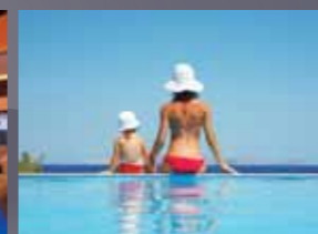
Main family pool