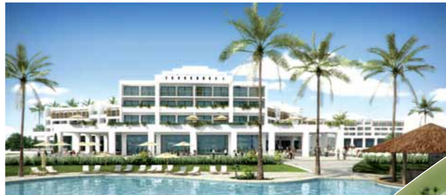
Main hotel building

In fact, as a property owner, you would not just be purchasing a 5-star property; you would be making a secure investment in one of the world's most thriving tourism markets.