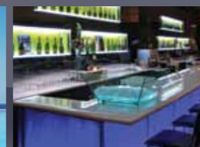
Beach shops & bars