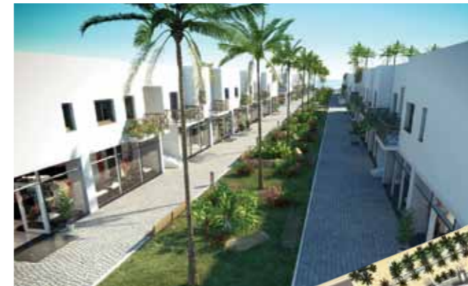
View of the boulevard