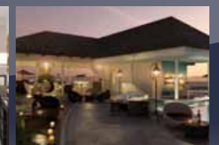
Beach & pool bar