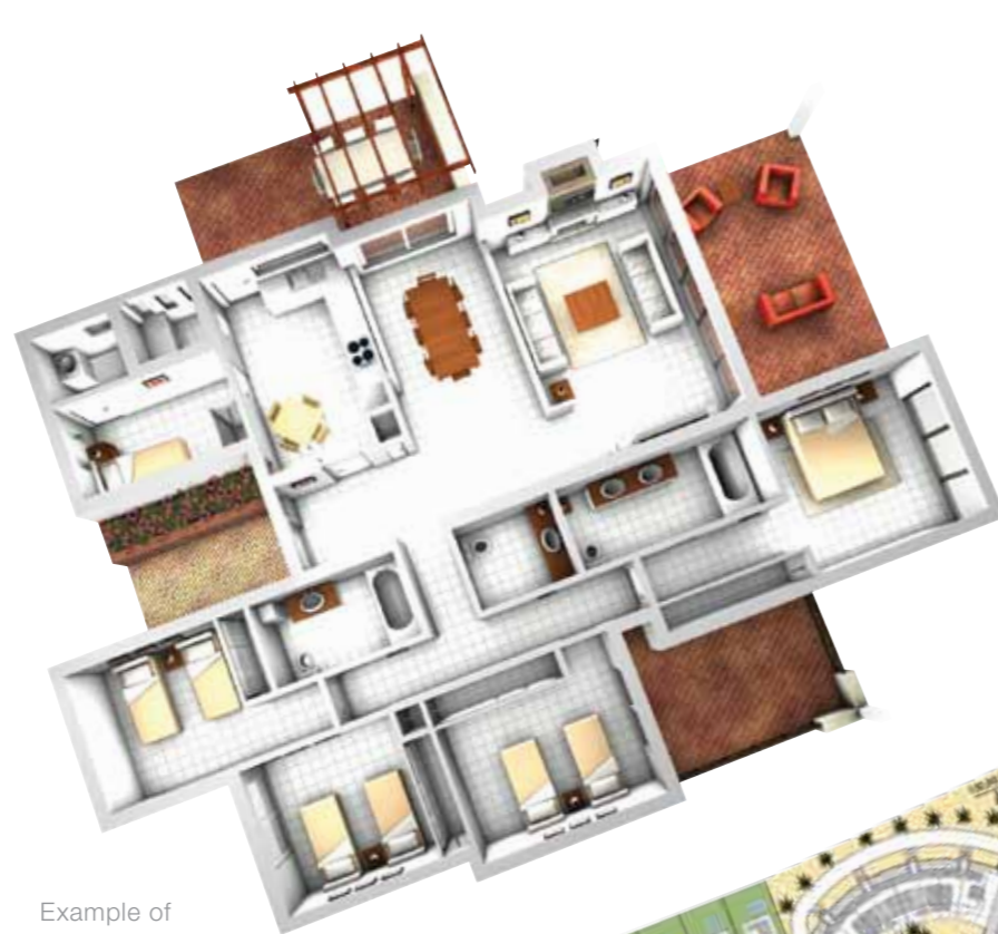
Example of villa layout

The completed resort will be operated and managed by the largest resort hotelier in the world and our partners, Meliá Hotels International. Under their 5-star MELIÁ brand, Dunas will become a truly world-class tourist destination.