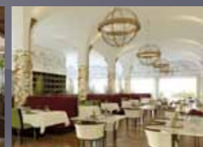
Fine dining restaurants