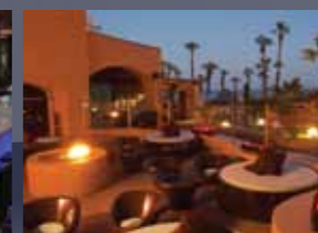
The Gabi Club®