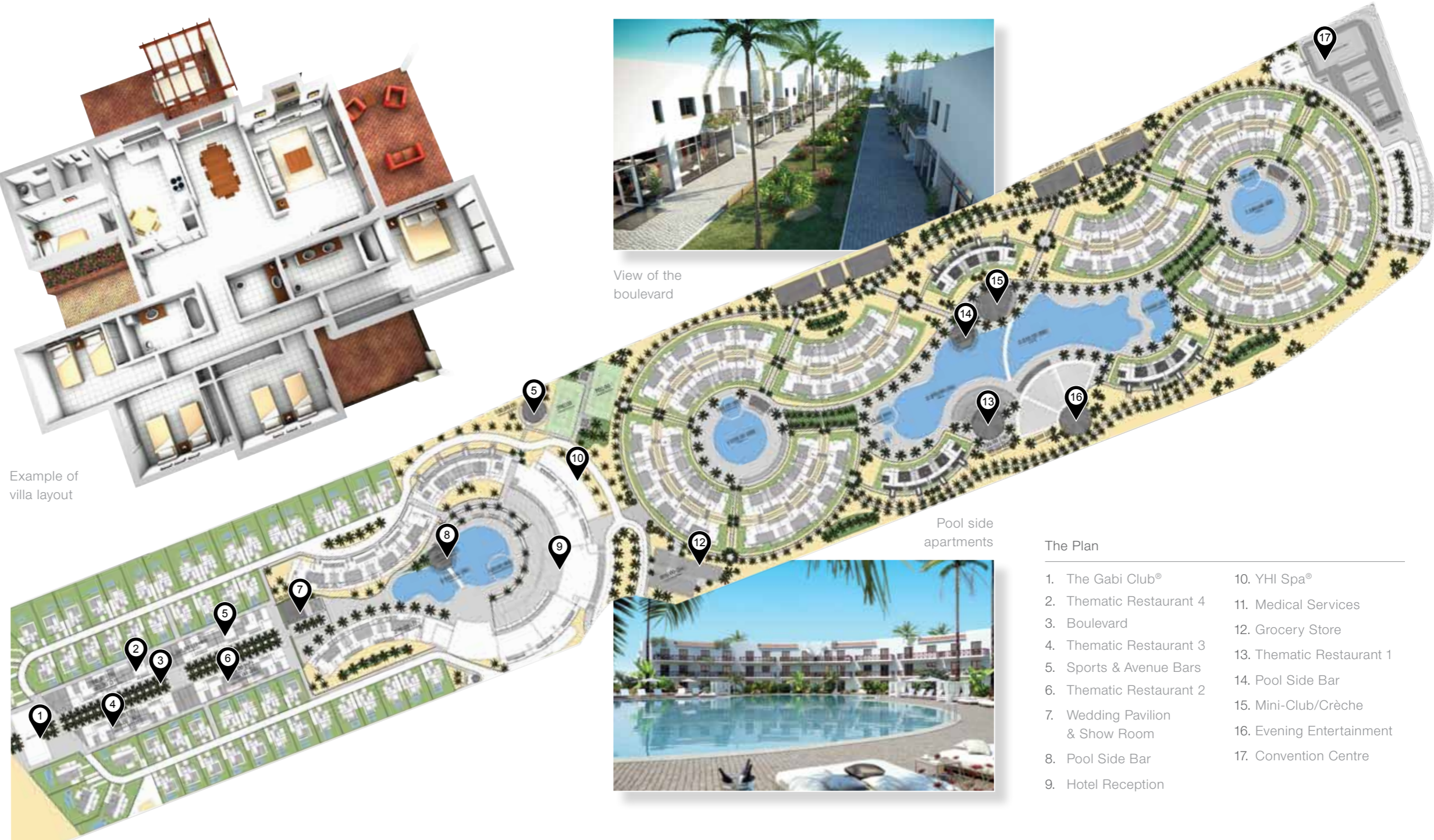
Pool side apartments