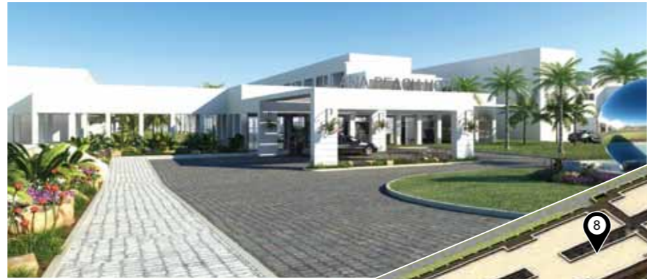
Entrance to the hotel

This all-suite hotel has an array of world-class holiday facilities and like all of our all Sal Island Resorts, Llana Beach Hotel will be managed by our partners Meliá Hotels International, ensuring an unforgettable guest experience.